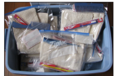
Hygiene kits for Haiti

On Sunday, January 17, children and youth at FCCB followed Dr. Martin Luther King, Jr.'s instructions of responding to their brothers and sisters in need. Children from third grade to high school put together 24 hygiene kits for Haitians trying to survive in the